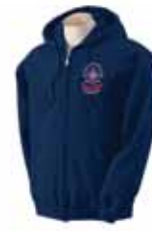
Navy Blue Zip-Up Hoodie