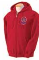
Red Zip-Up Hoodie