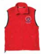
Red Fleece Sleeveless Zip-Up