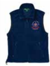
Navy Blue Fleece Sleeveless Zip-Up

Thunderbirds 60th Anniversary outer wear is now available through Flightline America. To order, download a form from www.tbaa.org or call Diane at 970-250-8741. A percentage of sales benefits the TBAA. Items will be for sale at reunion as well.