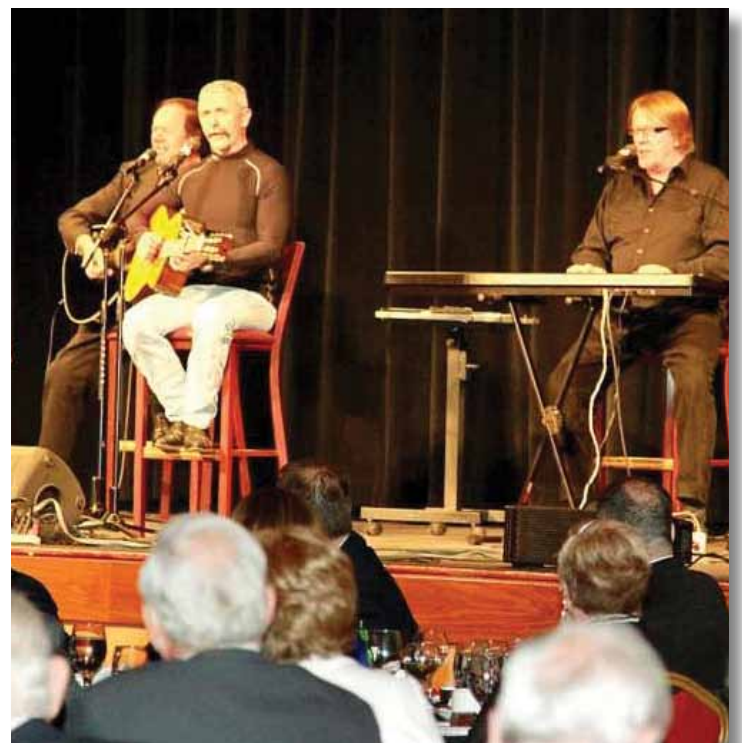
Country star Aaron Tippin performs at the banquet to conclude Reunion 2011.

Attendees were then treated to a performance by country star Aaron Tippin, which concluded the banquet.