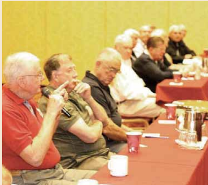
Alumni had an opportunity to ask questions during the TBAA business meeting held during Reunion.

The Facebook group (Thunderbirds Alumni) has more than 600 members on the popular social networking site. It's a private group – only alumni, associates, honoraries and family members are granted access.