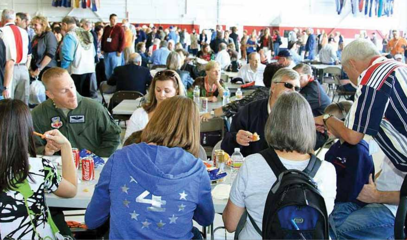
More than 500 people crowded into the Thunderbirds hangar as Team members grilled hamburgers and hot dogs for lunch during Reunion 2011.