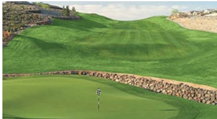
The Revere Golf Club will again host the reunion golf outing Thursday morning Nov. 12.

The Lexington's stunning 7,143-yard, par-72 layout will test shot-making capabilities with classic risk/reward scenarios.